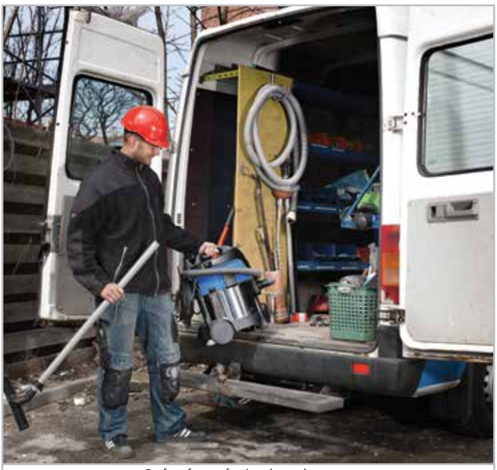
Perfect for professionals on the move

Q. Can I use my shop-style vacuum to collect lead debris? A. According to the EPA's website, "renovation firms should look for a vacuum cleaner that was designed to be operated with a HEPA filter, rather than a shop vacuum that can be fitted with a HEPA filter in place of the original basic filter."