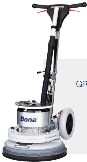
Bona Power Drive®