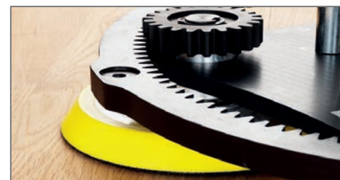
Dynamic cog system for sanding power.