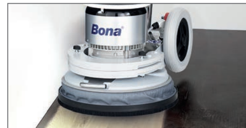
Works closer to walls and minimizes edge sanding.