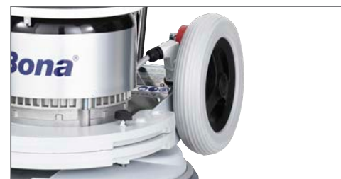
Large wheels for easy transport.