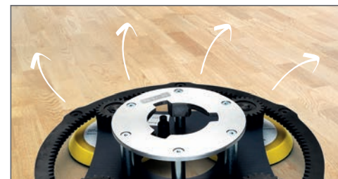
Direction-free sanding for optimum smoothness.

With large wheels and a compact design, the Bona Power Drive can be easily moved between rooms and up and down stairs.